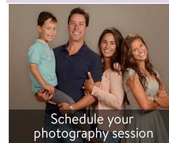
Schedule your photography session

Our member site URL: https://booknow-lifetouch.appointment-plus.com/yqlr8314/